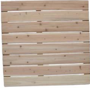
Cedar Deck Section PN 10870

3. Decking is available in Cedar Drop-in Sections (PN 10870) or in Poly Dock-Top™ Sections (PN10860). Four molded Dock Tops and at least 6 Deck Clips (PN 10869) are required to assemble each 4x4 Poly Dock-Top™ Section.