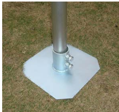
(1) Post Foot Plate PN 10811