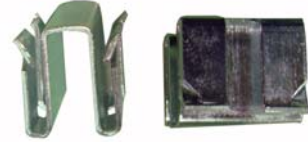
Deck Clips PN 10869

4. Various Roll-in Kits are available for Patriot Docks: Shore End Roll-In Kit (PN 10824) with 4-ft axle and 4-ft posts for shore end or shallow applications; 4' Wide Roll-In Kit (PN 10825) with 4-ft axle and 6-ft posts for straight dock applications (note: posts may be ordered longer as necessary); and 8' Wide Roll-In Kits (PN 10826) with 8-ft axle and 8-ft posts for patio/platform docks. The wheel adds one foot to support height.