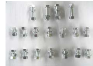
(12) 3/8-16 X 1.0 Bolts/Nuts (6) 3/8-16 X 1.62 Bolts/Nuts

2. The Support Post Assembly , PN 10816 - 10819 includes 1½ Schedule 40 Galvanized Support Pipe available in 4 ft, 6 ft, 8 ft and 10 ft lengths plus the following components: