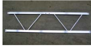
(2) Middle Rails (Same as End Rail PN 10803)