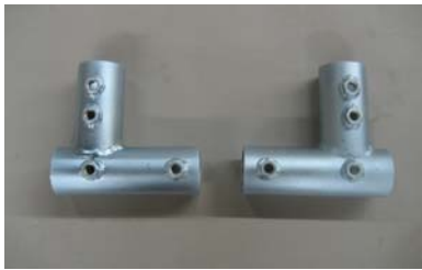
(1) Axle Converter (pair) PN 10820

Each Roll-in Kit includes 2 Pipe Post Brackets, 2 Support Pipes, Axle Pipe, Wheel Clamps and Wheels