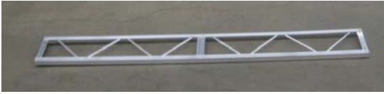
(2) Side Frames

1. The 4'x 8' Aluminum Truss Frame , PN 10800 includes the following components: