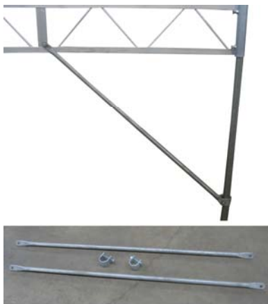
Optional Deep Water Pipe Brace Kit PN 10828