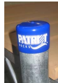
(1) Vinyl Cap PN 10823