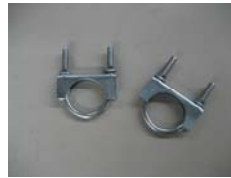
(1) Wheel Clamp (pair) PN 10822