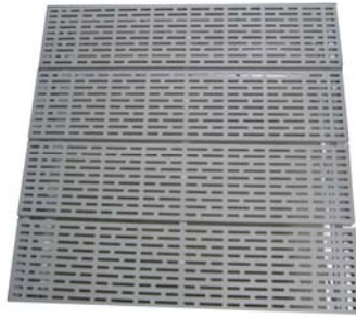
Poly Dock-Top Section PN 10860