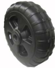
(2) Plastic Wheel PN 10821