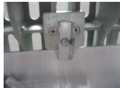
Deck Lockers PN 10867