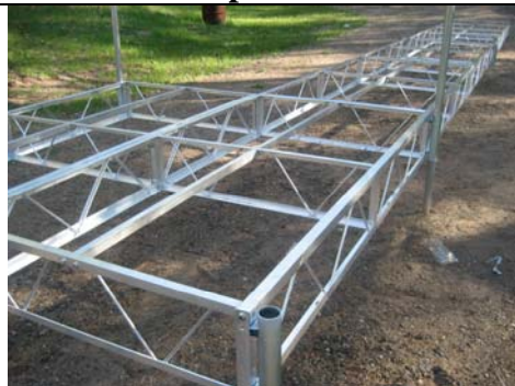
Raise dock slightly