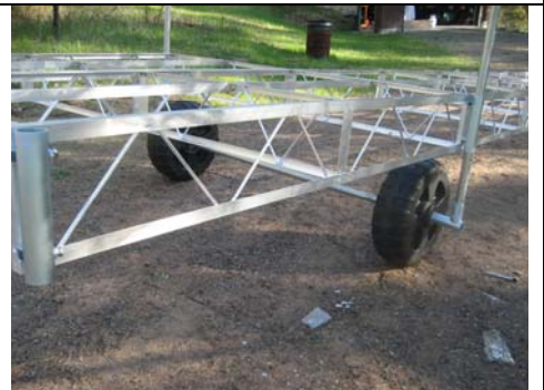
Lift and install axle w/wheels