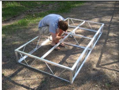
Assemble 4x8 patio frame