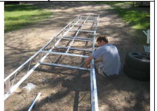
Continue with other frames