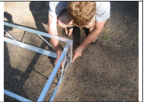
Tighten all frame bolts