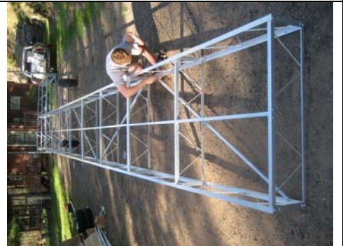
Frame brace pattern