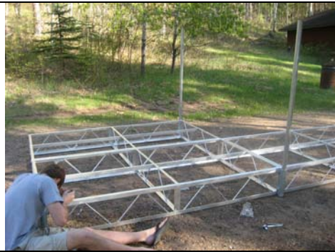
Place roll-in posts in brackets