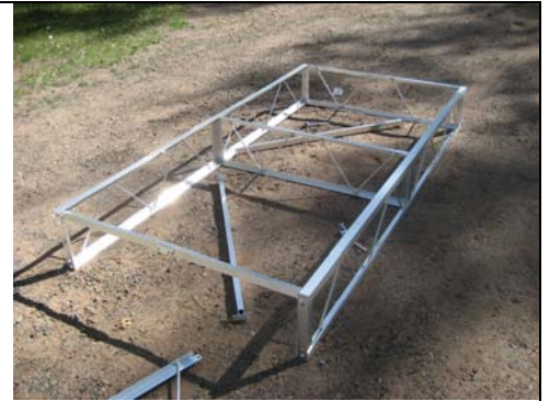
Loosely assemble 1 st frame