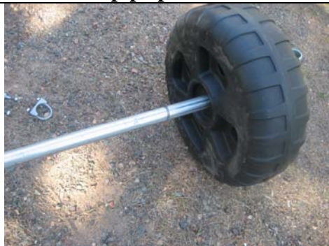
Slide on washers & other wheel