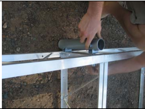
Install pipe post brackets