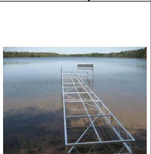
Completed frame in water