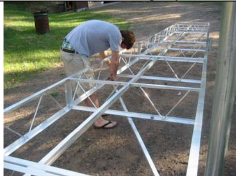
Install underside frame braces