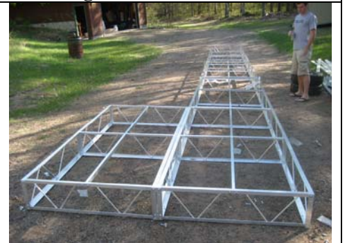
Attach patio to main dock (Add bench uprights now)