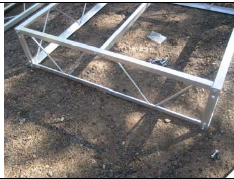
Lake end view