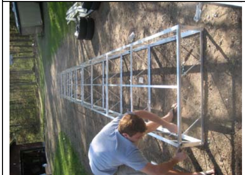
Continue tightening bolts