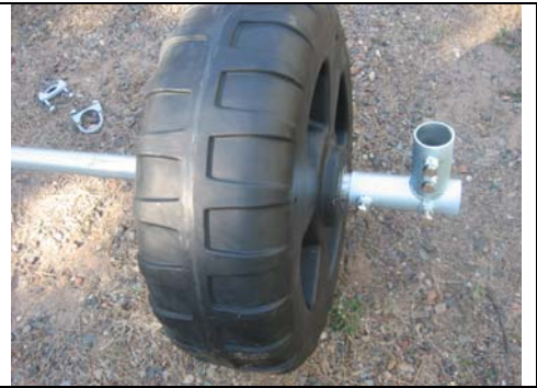
Slide wheel & connector on axle