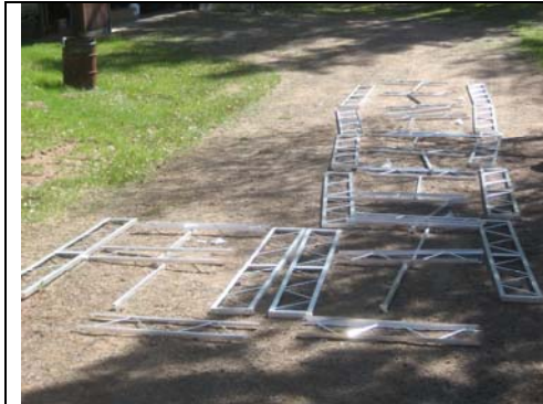
Lay out frames