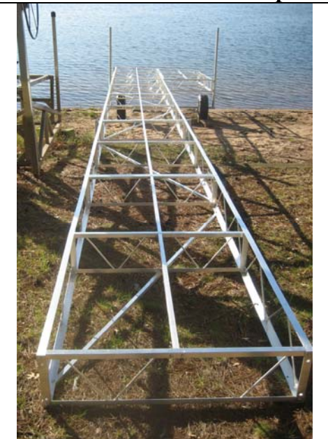
Roll dock into position