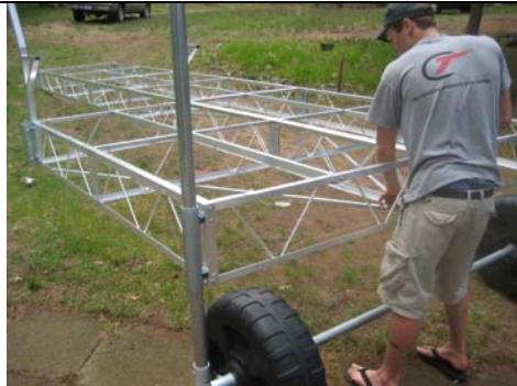
Alt. wheel location at end of patio