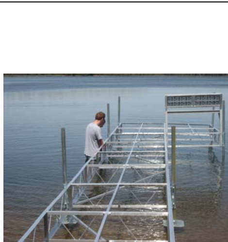
Level dock frame in water