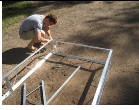
Start at Shore end