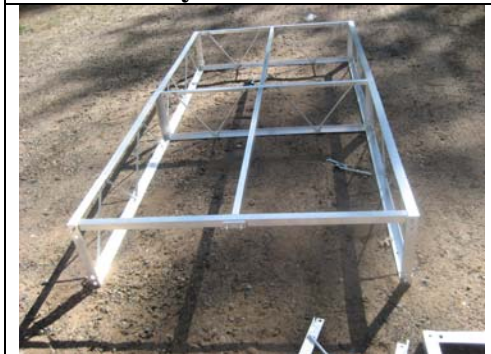
Attach connector rail